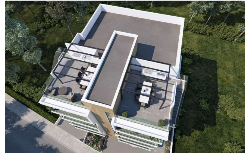
Salt Lake View